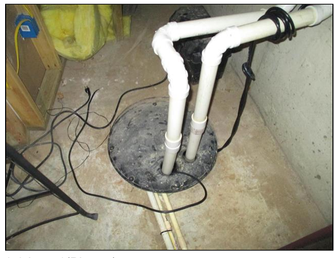
9.6 Item 1(Picture)

9.6 I was unable to test the sump pump because it had a submersed switch and a sealed lid. I found no evidence of water back up and the pump appears to be working properly.