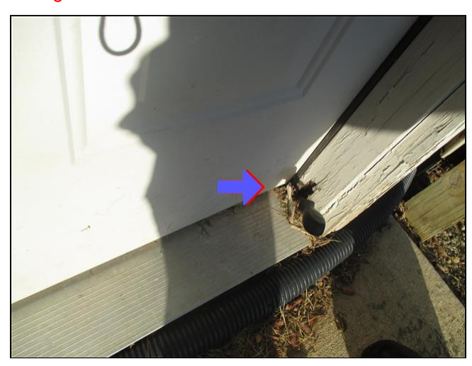
1.5 Item 1(Picture)

1.5 The rear door entering the garage requires repair to the wood frame due to decay and then painted to prevent further damage.