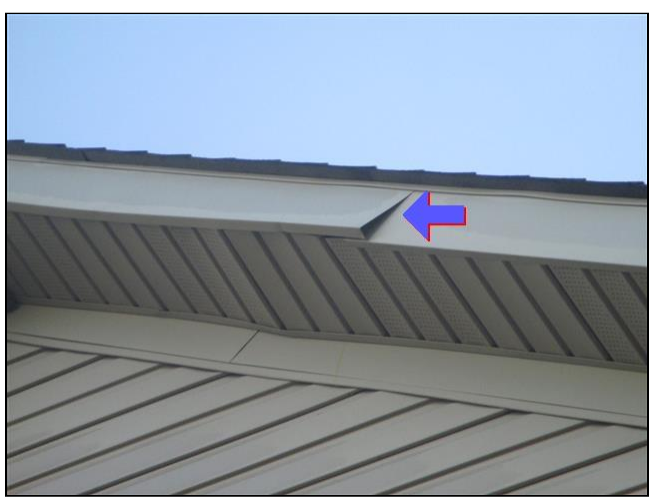
1.4 Item 1(Picture)

1.4 There is trim above the garage that requires adjustment to prevent further damage.