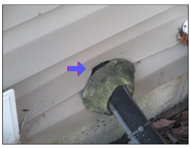
1.1 Item 1(Picture)

1.1 The opening around the air conditioner line requires sealing. This will prevent water and bugs from entering the home.