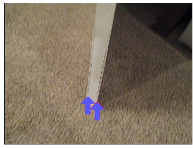
7.4 Item 1(Picture)

7.4 There is one door in the basement that needs adjusted. It is to long and dragging the carpet. This is causing damage to the bottom of the door. This needs to be fixed to prevent further damage.