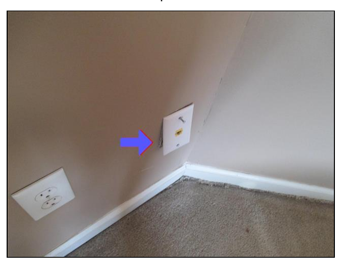
7.6 Item 1(Picture)

7.6 There's a loose cover plate in the Master Bedroom that needs attached.