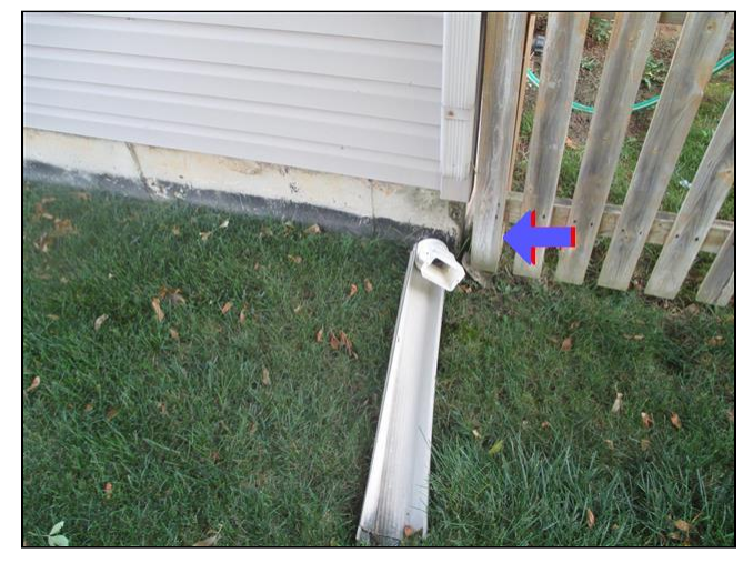
2.4 Item 1(Picture)

2.4 Downspout on right rear corner needs adjusted to direct water away from the foundation.