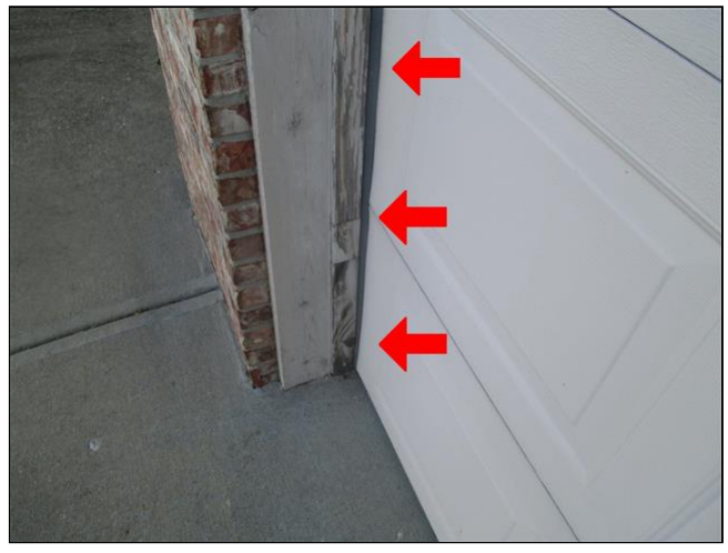
1.3 Item 1(Picture)