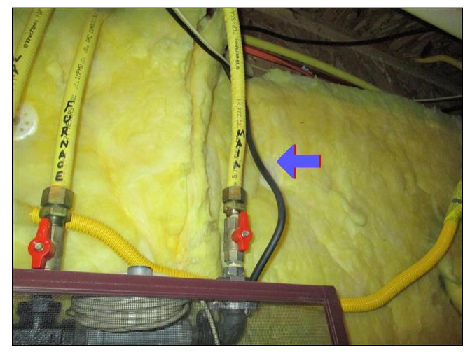
9.5 Item 1(Picture)

9.5 The main gas shut off to the home is located in the utility room in the basement. Just to the left as you walk in.