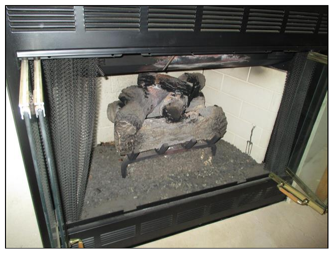
11.7 Item 1(Picture)

11.7 I was unable to light the gas log. It looks recently used and in good condition. I recommend having the owner go over the lighting procedure prior to purchase.