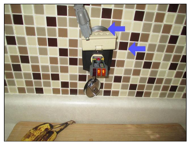
5.14 Item 1(Picture)

5.14 The microwave is plugged into the GFI circuit of the kitchen through a grounding adaptor. The microwave requires it's own dedicated outlet with proper grounding. I recommend that this be inspected and corrected by a qualified electrician.