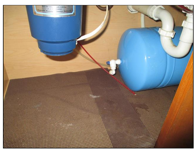
5.7 Item 1(Picture)

5.7 The water filtration system under the kitchen sink has been dismantled. I recommend either repairing the unit or removing it totally.