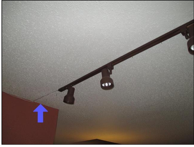
5.8 Item 1(Picture)

5.8 The ceiling fixture in the kitchen is not permanently wired into the home. To turn the fixture on and off you have to plug and unplug the fixture into an extension cord located by the fridge. While this is not a violation I do recommend caution when plugging and unplugging a light fixture to turn it on and off.