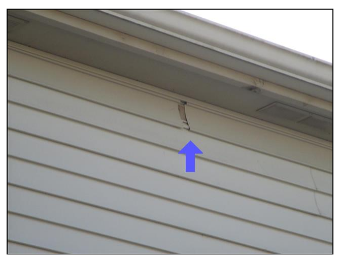
1.3 Item 2(Picture)

1.3 (2) Siding on the rear exposure of the home has slipped out of place. This requires repair to prevent water and other elements from getting behind the siding and causing damage.