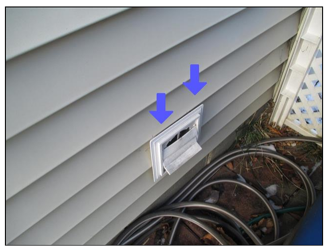
1.3 Item 1(Picture)

1.3 (1) Dryer vent has a missing cover fin. This requires repair to prevent water and other outside elements from entering the home.