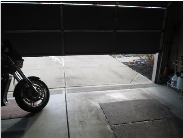
4.5 Item 1(Picture)

4.5 I had trouble getting the door to reverse when resistance was applied. I recommend having the garage door sensor adjusted prior to use.