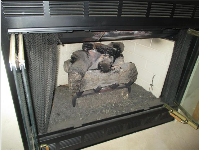
11.7 Item 1(Picture)

11.7 I was unable to light the gas log. It looks recently used and in good condition. I recommend having the owner go over the lighting procedure prior to purchase.