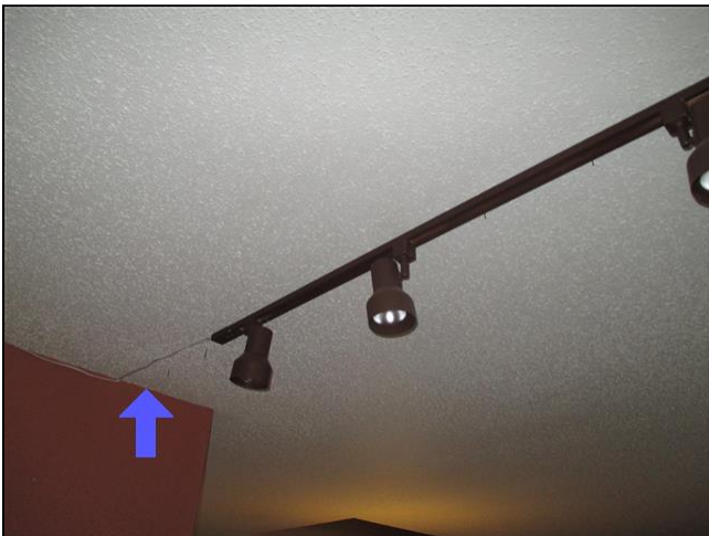
5.8 Item 1(Picture)

5.8 The ceiling fixture in the kitchen is not permanently wired into the home. To turn the fixture on and off you have to plug and unplug the fixture into an extension cord located by the fridge. While this is not a violation I do recommend caution when plugging and unplugging a light fixture to turn it on and off.