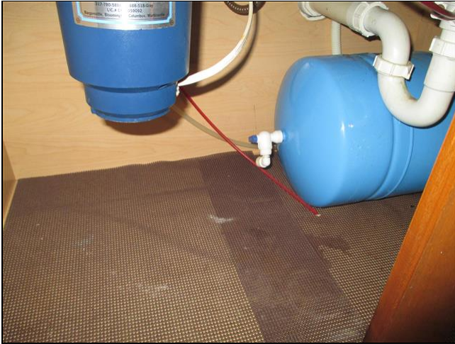
5.7 Item 1(Picture)

5.7 The water filtration system under the kitchen sink has been dismantled. I recommend either repairing the unit or removing it totally.