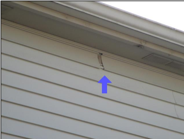
1.3 Item 2(Picture)

1.3 (2) Siding on the rear exposure of the home has slipped out of place. This requires repair to prevent water and other elements from getting behind the siding and causing damage.