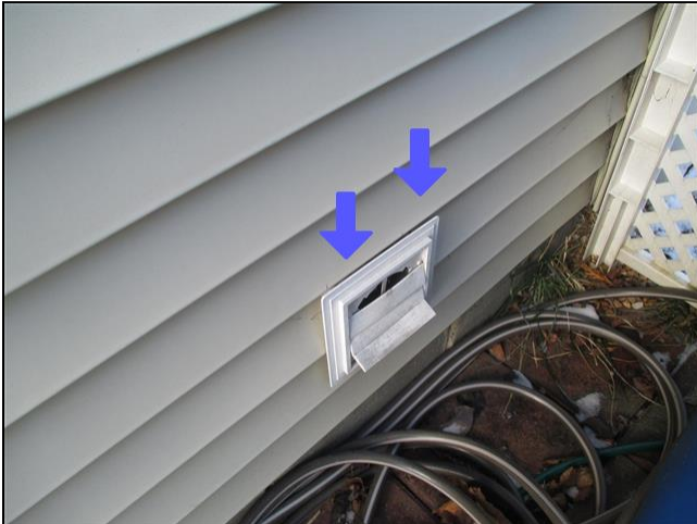
1.3 Item 1(Picture)

1.3 (1) Dryer vent has a missing cover fin. This requires repair to prevent water and other outside elements from entering the home.